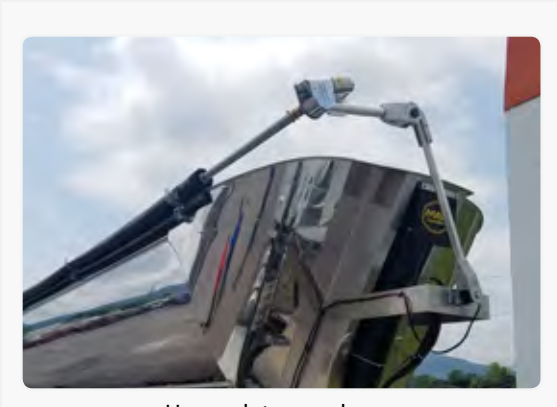
Heavy-duty arm shown