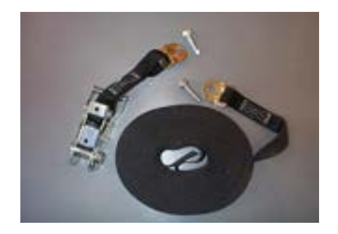
Ridge Strap - R0135B