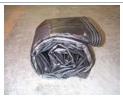
STEP 4: TARP PREPARATION

Begin by installing the first stop with the center of the stop body bracket at the rear of the front cap. Then install the rear stop with the center of the bracket at the front of the cap. Space the remaining stops evenly across the trailer. Note: mount the stops so that the top of the bracket is flush with or as close as possible to the top of the top rail on the trailer.