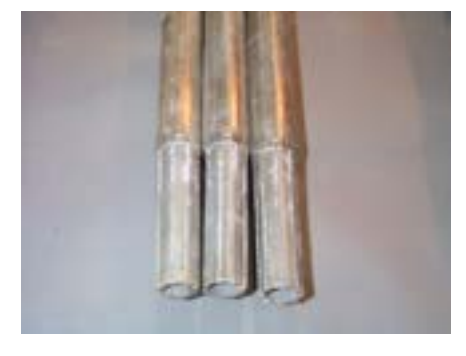
Roll Pipe (per trailer length) - R0108