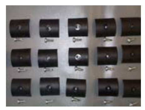
15 "U" Clamps - R0109