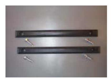
Polly Roll Protectors - R0144