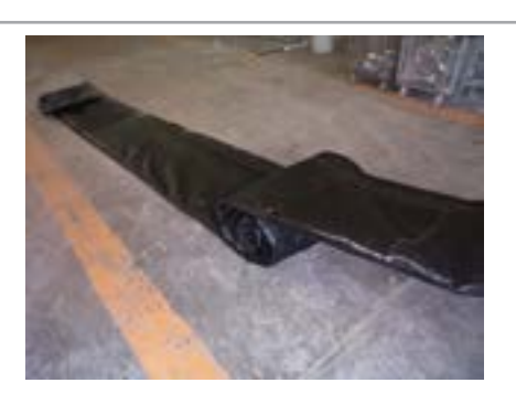
4A: Unroll the tarp on the ground near the trailer.