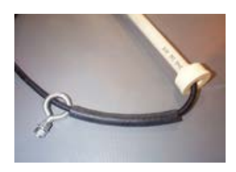
Roll Return - R0171