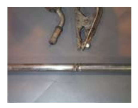
Anchor Piper (per trailer length) - R0118