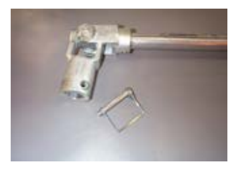
"U" Joint for Crank - R0112UJ