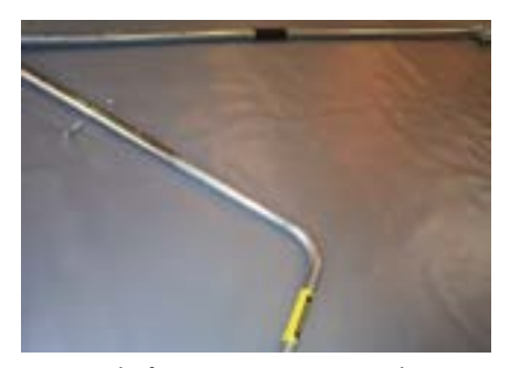
Crank for Open Top Trailers - R0112LRF