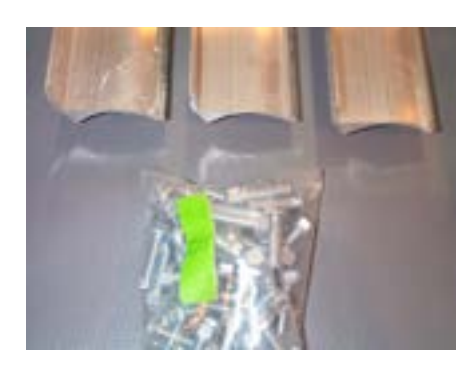
Latch Plate (per trailer length) - R0170