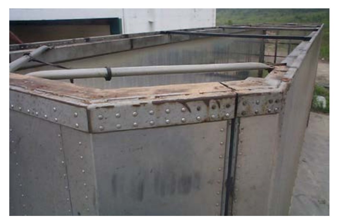
Open Top Chip Trailer