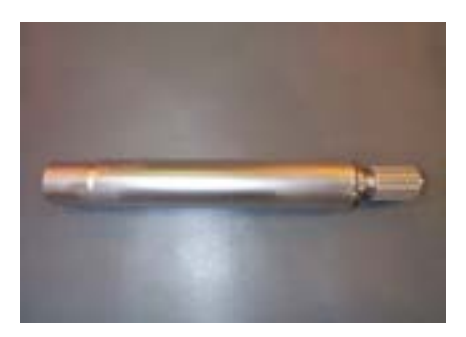
Spline Weldment - R0141W