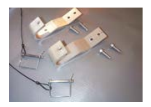
Crank Retaining "J" Hooks - R0112RA