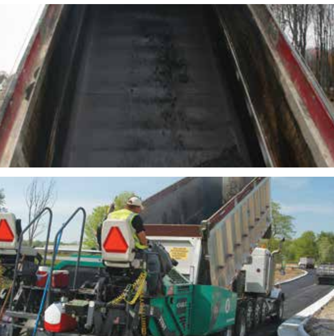
Field Wear Performance