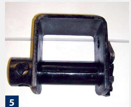
(1) Airbag material is reinforced with vinyl and steel cables (2) Electric motor option raises and lowers the main cable (3) Steel bearing rollers for smooth operation (4) Hoops lock the tarp compactly out of the way (5) Manual winch option